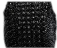
Airez Inner Shell