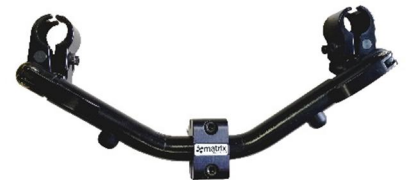
Ultra Lightweight Mounting Hardware