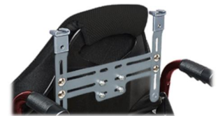
Shoulder Harness Guides Installed