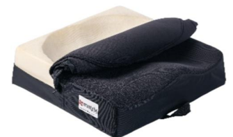
Matrix Custom Seat Cushion E2609 with Spacer Fabric Cover

* Only recommended for patients with chronic incontinence.