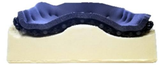
Adjustable Matrix Insert for E2609

*Provides unlimited growth and adjustment during the two-year warranty period. Includes changes in body shape, pelvic alignment, width, length, and height. New covers must be purchased separately as needed.)