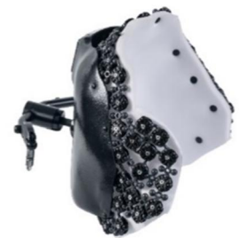
Original Matrix Inner Shell with Radian 360 Hardware