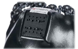
Universal Headrest Mounting Interface