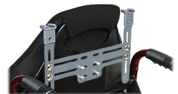
Integrated Accessories Mount