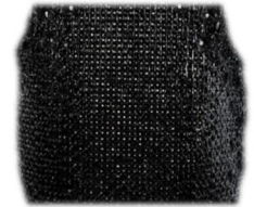
Airez Inner Shell