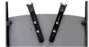
Shoulder Harness Guides Installed