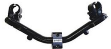
Ultra Lightweight Mounting Hardware