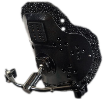
Airez with Radian 360 Hardware